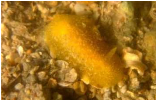
Figure 4: Doris grannulosa (Pease, 1860)

Observed Specimen (Figure: 4) was having translucent body with uniformly yellow colour. The specimen was found under the loose rock boulder and was feeding on sponge. The body was oblong, convex from above and covered with numerous minute irregularly placed granules. The main feature is the arrangement of gills. Observed specimen had rudely pinnate gills which were directed posteriorly (Pease 1860, Gosliner, 2008). The length of the observed specimen was 15 mm while Gosliner (2008) collected specimen had length of 20 mm.