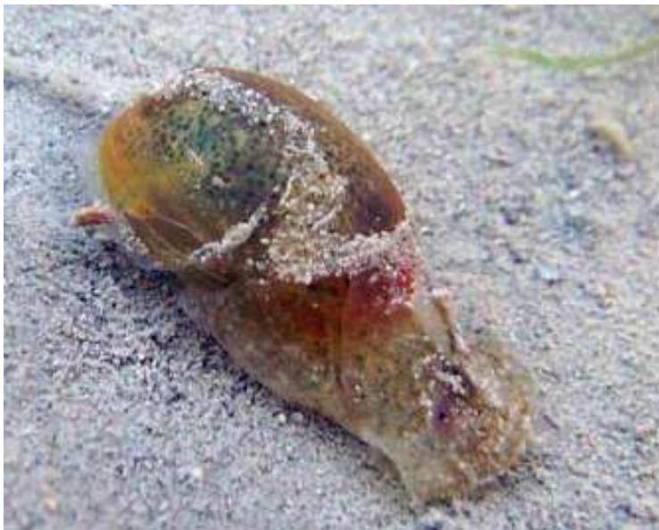
Figure 3: Haminoea alfredensis

Observed Specimen (Figure: 3) was having translucent body with dull yellow coloured with greenish yellow background shade; dark brown and yellow spots on dorsal side; short foot with brown spots.