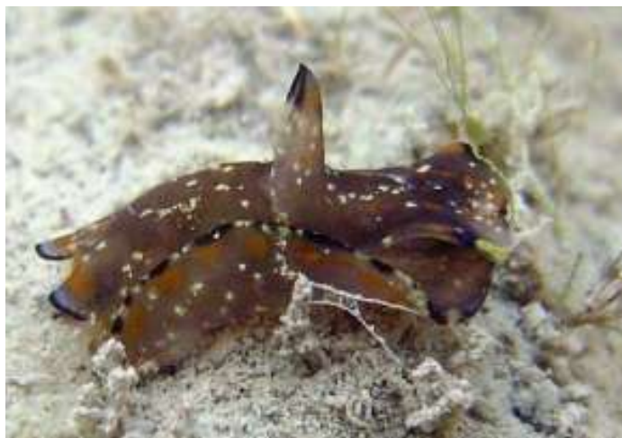
Figure 2: Philinopsis speciosa

Observed specimen (Figure: 2) was having translucent brown to an opaque dark brown body colour; pair of yellow parallel lines on the head-shield on either side of the midline; small white spots which may indicate juvenile stage; blue-black coloured margin of the parapodia with yellow markings (Rudman, 1972).